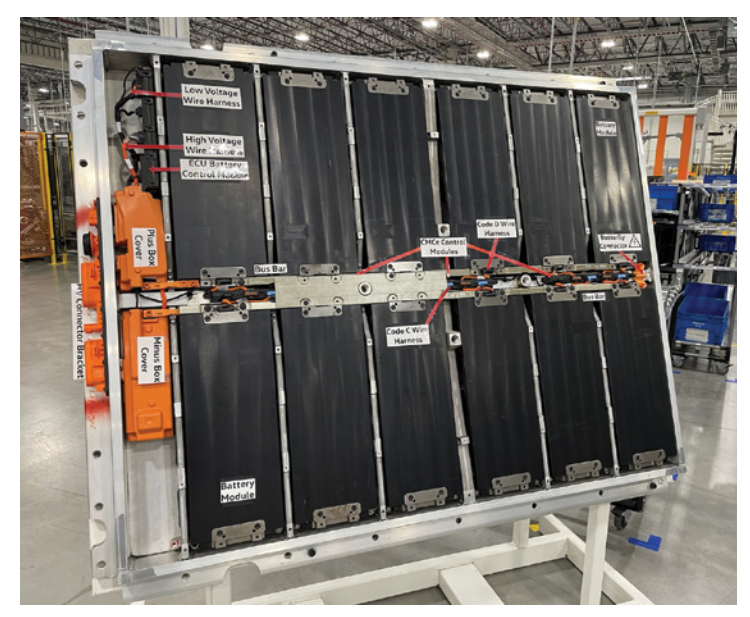
An example of the current ID.4 battery pack on display in the Chattanooga packassembly plant. This 82 kWh pack uses LG-supplied NCM712 cells and weighs 493 lb. A new pack using SKI-supplied NCM811 cells recently entered production.